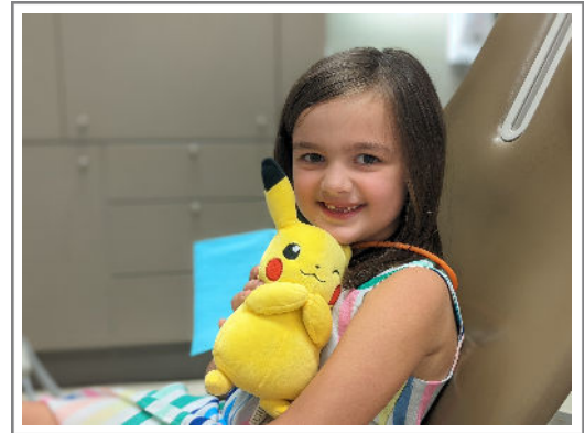
A pediatric patient at the Mounds View Center for Dental Health gets ready for a dental cleaning. www.appletreedental.org/services/pediatrics

Generous grant funding from the Medica Foundation, Anoka County FY2021 Community Development Block Grant (CDBG), Minnesota Department of Health’s FY2022 Clinical Dental Education Innovations (CDEI) grant, and the Park Dental Foundation support this important work. Nearly one in five children under the age of 12 experiences tooth decay, according to the U.S. Centers for Disease Control and Prevention. Lack of dental care causes many children to develop dental cavities, the most common disease in children. Untreated dental disease can cause problems with eating, speaking, playing, and cause children to miss school and other activities.